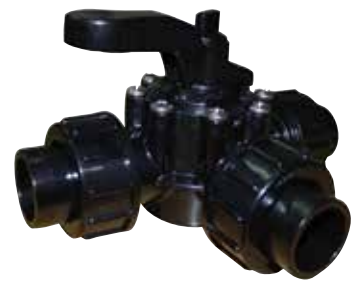
3 way 25/32mm valve threaded with half unions.