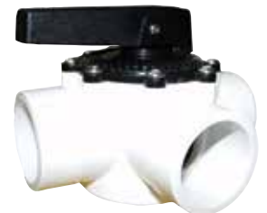
3 way 40/50mm slip fit valve