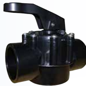
2 way 50/65mm slip fit valve