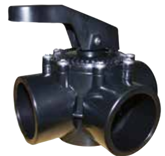
3 way 50/65mm slip fit valve