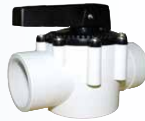
2 way 40/50mm slip fit valve

FPI valves are covered by a 12 month warranty against faulty materials and workmanship.