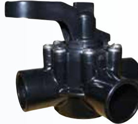
3 way 25/32mm slip fit valve